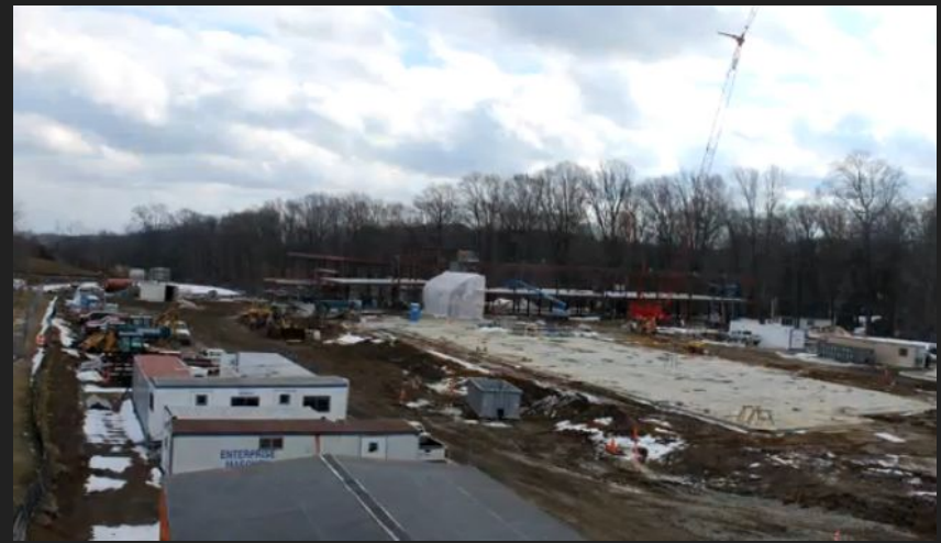
The construction of Cooke.